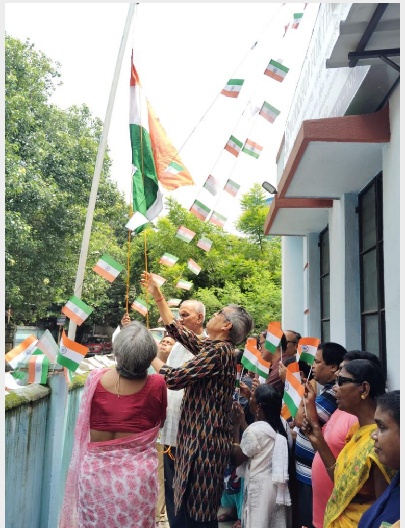
Flag hoisting at Workshop for Blind – 15 th Aug'24